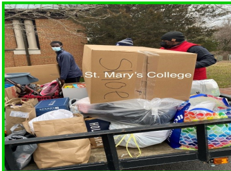
Collection of donated items at one of the three sites in St. Mary's County

The success of MLK Holiday's "National Day On" Campaign was attributed to a powerful coalition of organizations coming together to work for a single purpose-to serve the community both because of and despite COVID. The major hosts, sponsors and partners of the day in addition to Alpha Kappa Alpha Sorority, Inc.®, Nu Zeta Omega Chapter included the following: College of Southern Maryland, Immaculate Heart of Mary Church; Ivy and Pearls of Southern Maryland Charities, Inc.; St. Mary's Branch of the NAACP; St. Mary's County Human Relations Commission; St. Mary's College of Maryland; St. Mary's County Public Schools; Knights of St. Jerome; St. Mary's Ryken High School; St. Peter Claver Catholic Church; Southern Maryland Top Ladies of Distinction; The Mission; Alpha Phi Alpha Fraternity, Inc., Sigma Alpha Lambda Chapter; and WARM.